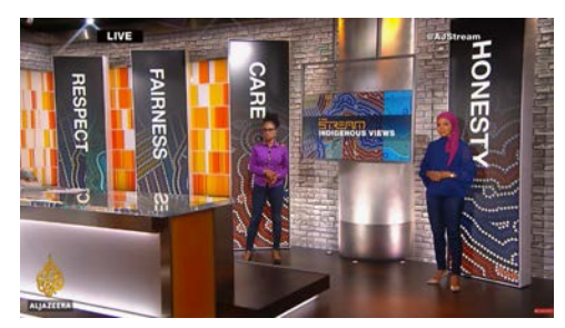
Al Jazeera The Stream: Is there an ethical way to research indigenous communities?

The show finished by showing the beginning of the video "We are the San" by !Khwa ttu kids – winner of the dance,