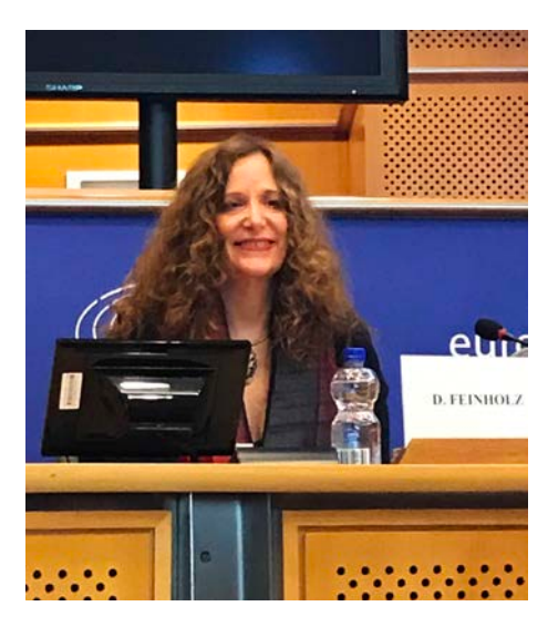
Dafna Feinholz, UNESCO:

"Research and innovation are needed to face humanity's challenges. But they need to be done in an ethical manner."